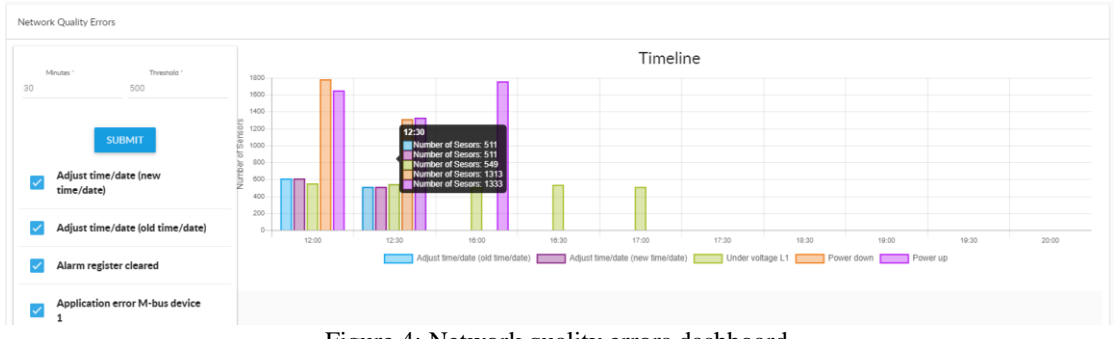
Figure 4: Network quality errors dashboard.

Another example of data visualization is illustrated at Figure 4, where the end-user can navigate at the network quality errors detection (Section 2.4), the similar events identification. The results are provided in a histogram-like visualization for the selection period, where the number of sensors with similar events occurred at the same time are presented. The user has the option to easily adjust the time period and the minimum number of sensors the events appear.